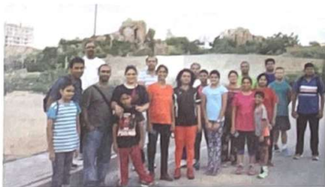
Peerancheruvu Neighborhood Committee